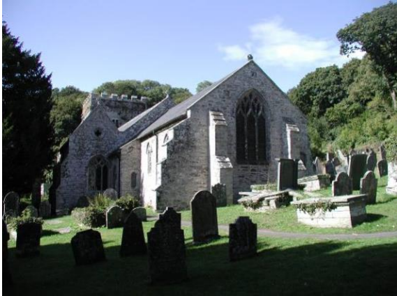
St Brynach's Church, Nevern

Compiled from gravestone inscriptions, parish registers, cemetery and cremation records and war memorials.