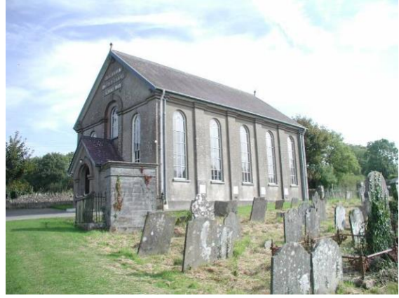
Blaenwaun Baptist Chapel, St Dogmaels

The author also provides commentaries on the George name, geographical distribution of families, variations of mortality over time, church history and non-conformism.